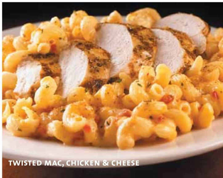
TWISTED MAC, CHICKEN & CHEESE

A 15% service charge will be added to your bill. 15%のサービス料が加算されます。