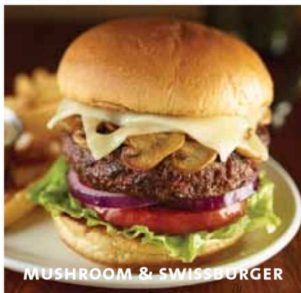
MUSHROOM & SWISS BURGER

†ナッツまたはシード(種子)を使用しております。*十分に加熱されていないハンバーガー、肉、魚、貝類及び卵を食べることにより体調を崩される場合もございます。特にお体の調子の優れない方または通院中の方はお気をつけ下さい。