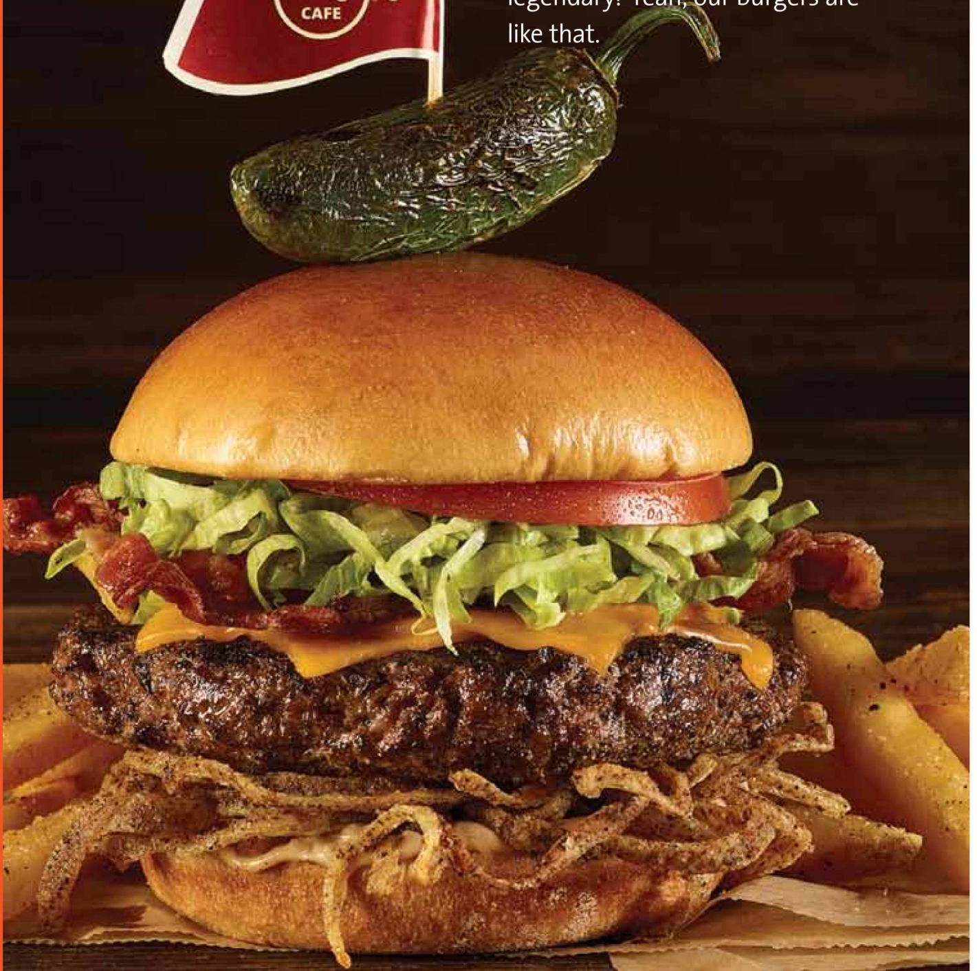
JAVA LAVA BURGER

You know how phenomenal artists take something real and raw and make it legendary? Yeah, our burgers are like that.