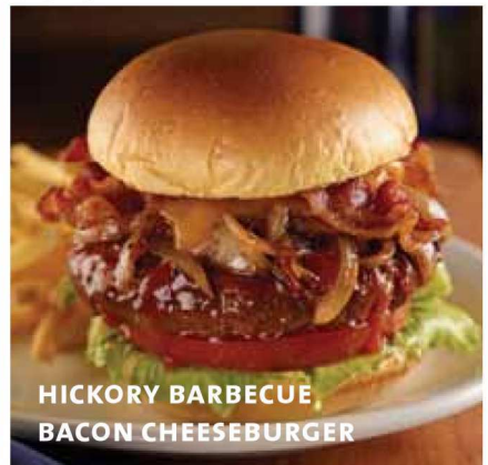
HICKORY BARBECUE BACON CHEESEBURGER